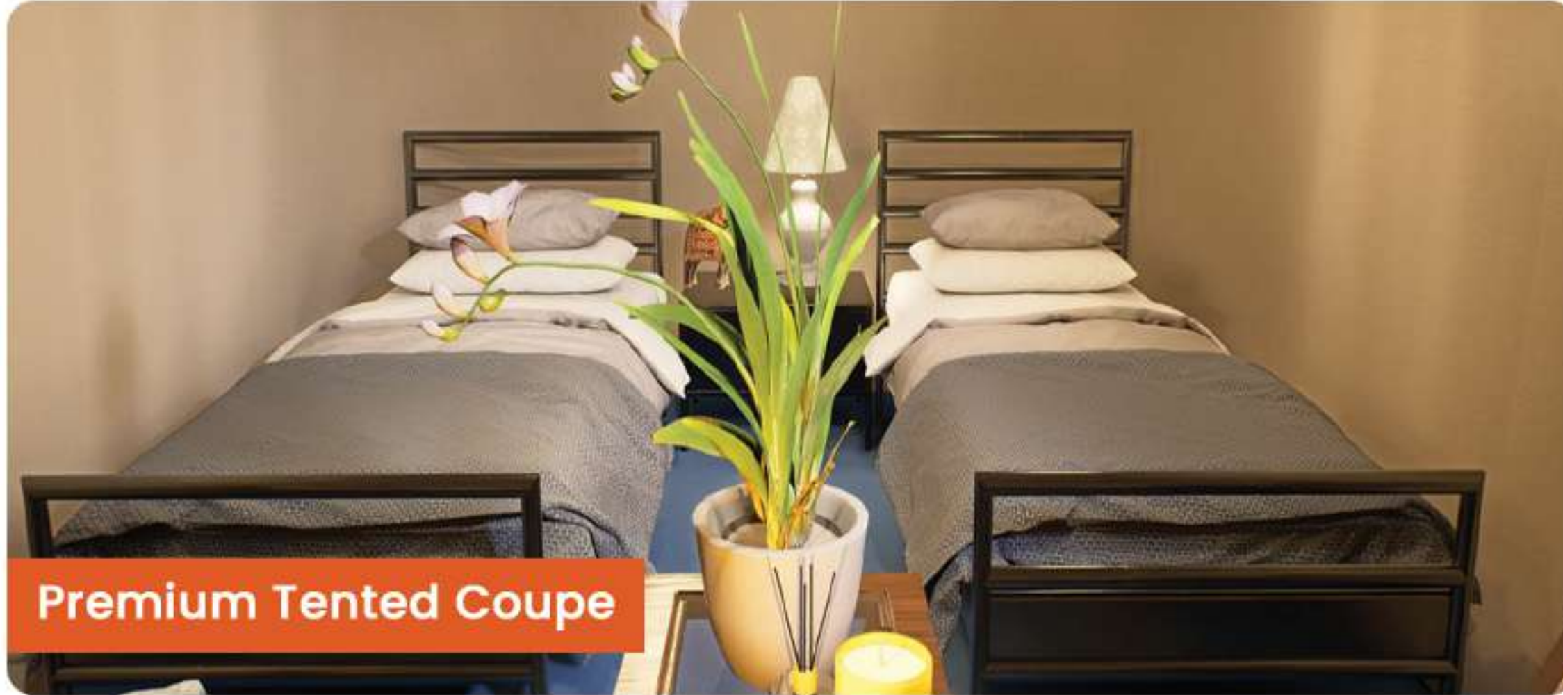
Premium Tented Coupe

Maha Kumbh (January 13 to February 26, 2025)